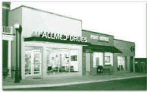
Sheriff's Office - STF Situational Training Facility.

I know many of you are probably wondering what is going on with the Situational Training Facility and have we just lost interest in it. Well, let me assure you it is still moving forward. While the pace is extremely slow, due to issues that we have no control over, it is still going to be built. The current status as of May 1st, is that the plans have been submitted to the County Planning Department for approval and we are waiting to hear back from them. Once we get the approval on the plans we will be engaging in a contract to have the first building built. This building will be a warehouse style building and can be used for numerous training efforts. I know this project seems to be going very slow, but we have all been working hard to get through all the obstacles that have been placed in front of us. Bottom line, it will be built.